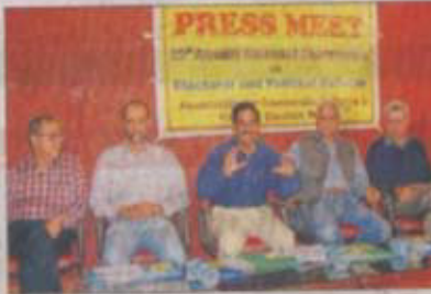
ADR and National Election Watch members at the news meet in Ranchi on Friday.

"Polls are fought on issues raised by political parties. Political issues are completely neglected. We will campaign for inclusion of such issues in the agenda of parties," he added.