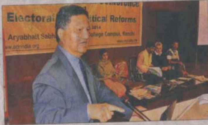
नेशनल इलेक्शन ऑथरिटी के सम्मेलन में बोलते निर्वाचन आयुक्त एचएस ब्रह्म

बाहरी छारखेंक से चुनाव जीत चुकते हैं संसद : भ्रष्टाचार पर नकेल के लिए लोगों को जागरूक करना जरूरी है। निर्वाचन आयुक्त एचएस ब्रह्म ने कहा कि छारखेंक से बाहर के उद्योगपति अक्सर वे जो वहां चुनाव जीत कर संसद पहुंचते हैं। लोगों को इसका विरोध करना चाहिए। वोट बेचें नहीं : मुजब अर्थिक स्पेक्टर शराब होकर पोशा ने कहा कि वोट बेचना नहीं। विधान के लिए आरंभ नहीं