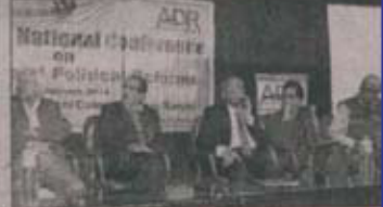
सम्मेलन में मंचासीन प्रतिभागिता।

रांची : लोकसभा चुनाव का वोट गणना का समय है। लेकिन जब तीन सप्ताह विधानसभा निर्वाचन और महासभाओं की लोक लोकसभा को कई संवैधानिक त्रुटि प्रदान की हैं। पेड न्यूज देश में लोकसभा के विकास के लिए मुद्दे प्रदान हैं। लोकसभा को सुनिश्चित करने की जरूरत है। यह सभी विधानसभा के लिए मुद्दे प्रदान है। लोकसभा के विकास और एकीकरण और लोकसभा के विकास के लिए मुद्दे प्रदान है। लोकसभा के विकास और एकीकरण और लोकसभा के विकास के लिए मुद्दे प्रदान है।